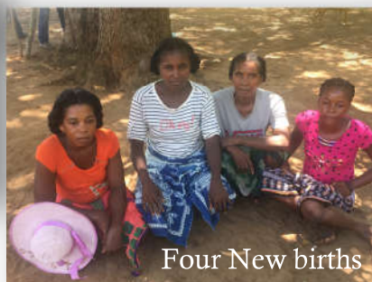
Four New births