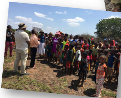
Welcome and ....