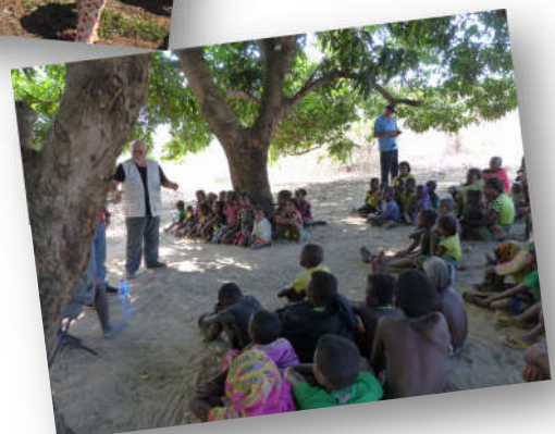
... and sharing the Good News